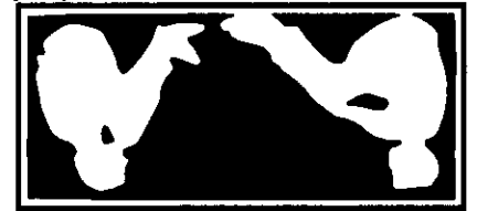
Summer Issue, 1999