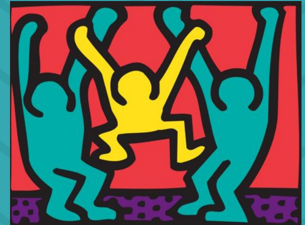
Keith Haring artwork

Association for the Development of the Person-Centered Approach